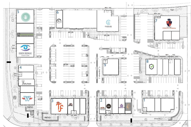
■ Pylon Sign